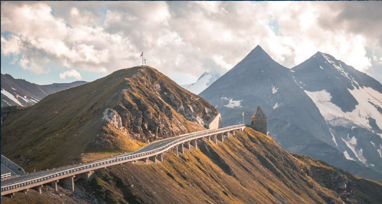
DAY 3 DRIVING AUSTRIAN ALPS

A unique and breathtaking journey awaits.