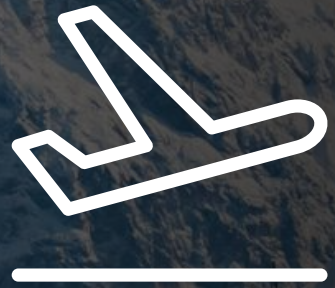
DAY 4 DEPARTURE