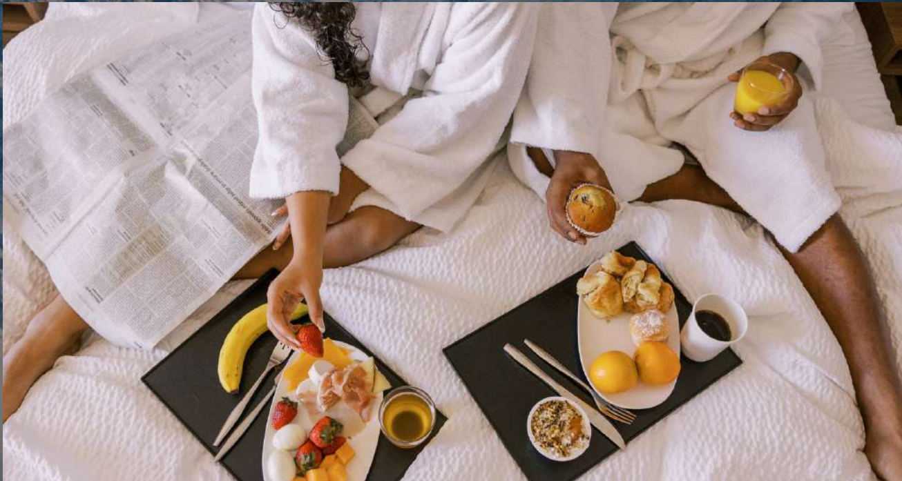
DAY 4 RELAX AND DRIVE