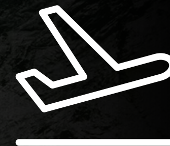
DAY 4 DEPARTURE