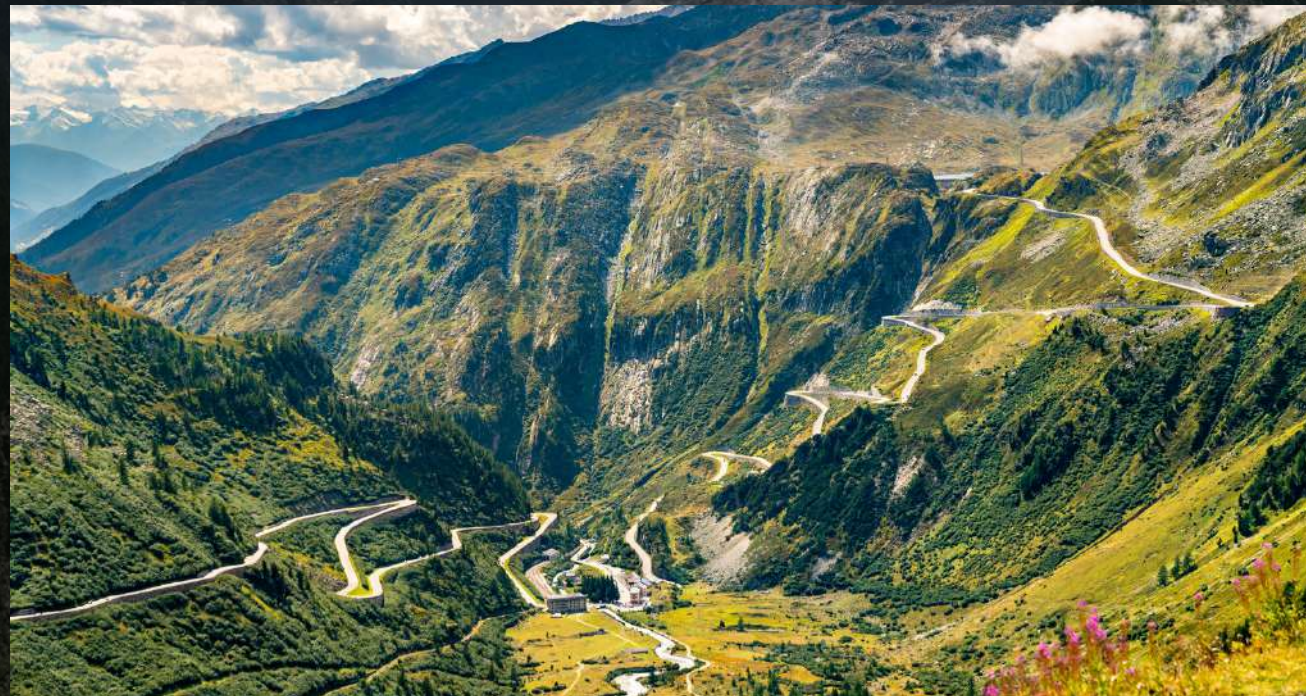
DAY 3 DRIVING THE BIG FIVE

A unique and breathtaking journey awaits.