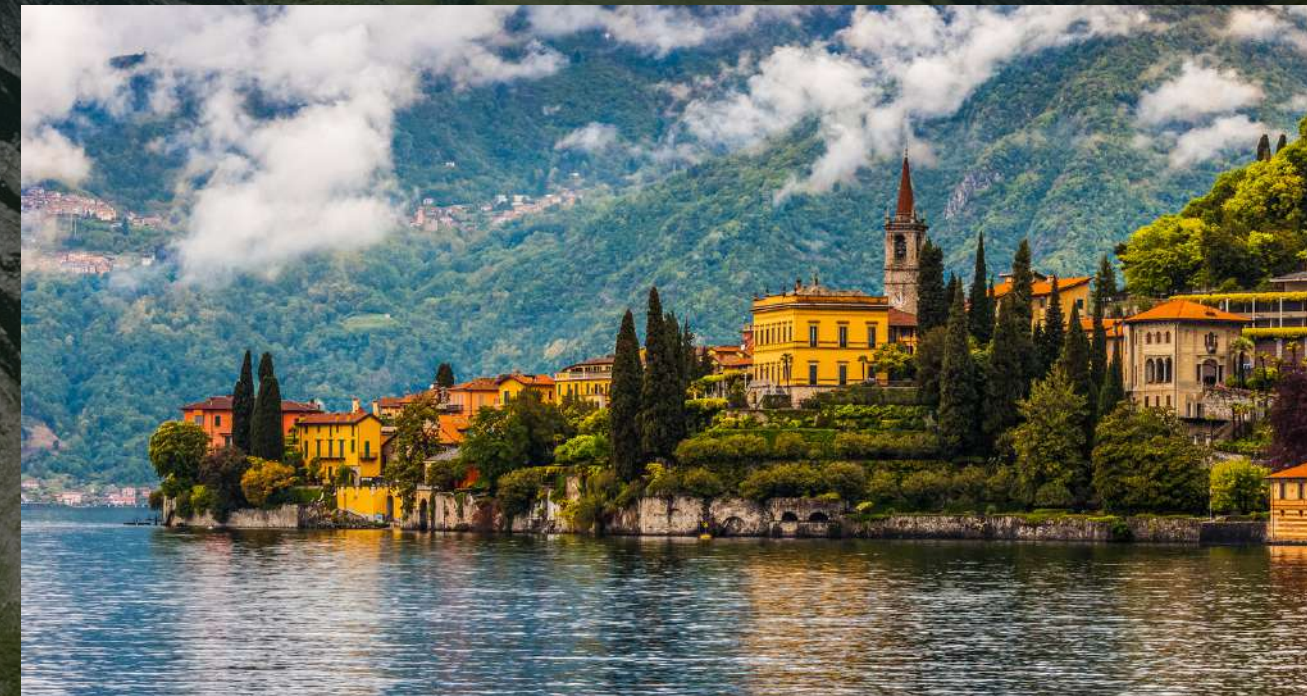
DAY 4 DRIVING LAKE COMO